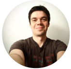
Luka PRO Architect