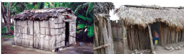
yagua used as exterior walls