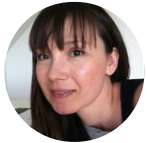
mariagroenlund PRO Design Jedi & Color Master