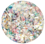
nuhuh PRO Designer