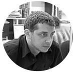
Gorlov PRO Architect