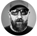
Tobamin PRO Botenstoff-Aktivist