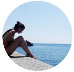
nininichvarak PRO Architect Designer