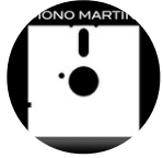
MonoMartini PRO Designer