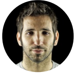
poemaurbano PRO Architect/Designer