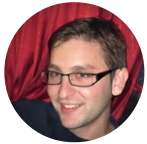
gorganvladionut Architecture student