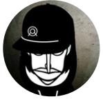
leonvlew PRO animator