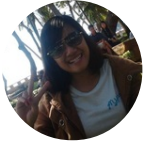
maya_maya_911 poor designer