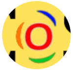
mtahaa Sustainability Engineer