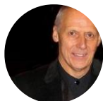
jhardwick2 PRO Graphic Designer