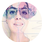
Grozda PRO student