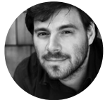
inspireby PRO Designer