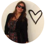
crislud PRO Creative Designer