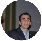
andrian PRO Design&Architecture