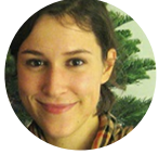
Chel_vH textile designer