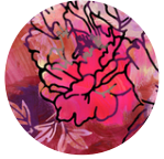
Lark PRO Design Director