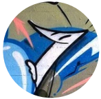
7tyfour PRO Artdirector