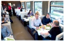
The old train replica restaurant

Less than one third of the overall bridge used, cut in such a way to create slanted angle, giving a new look to the old bridge. Replica of the old train complete with the interior act as a restaurant offering nostalgic indulgence and great view of the Danube River.