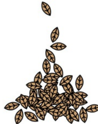
not that much space and easier to decompose