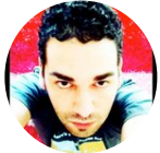
MasterStroke Industrial Designer