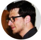
voinealex PRO Architect