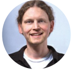
Indiego PRO Art Director