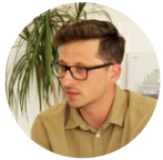
voinealex PRO Architect