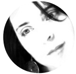
joanaf PRO DESIGNER