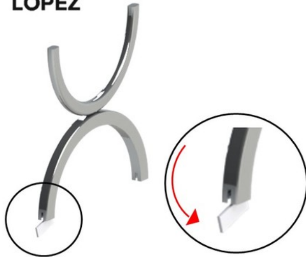
Fits in the seat's sliding part