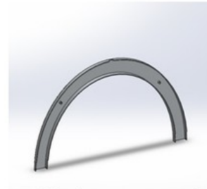
Each piece is formed by two components, which makes it hollow and easy to carry.