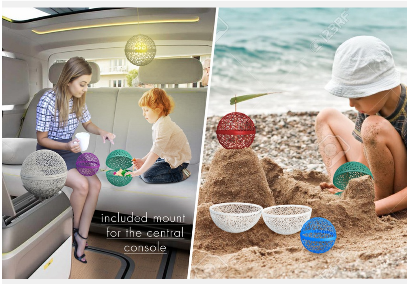
included mount for the central console

A truly artistic object for VW ID Buzz that also covers your recreation moments!