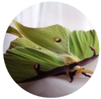
schoolaintsobad PSU Grad Student